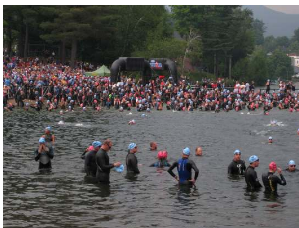
Ironman Lake Placid, July 21, 2008