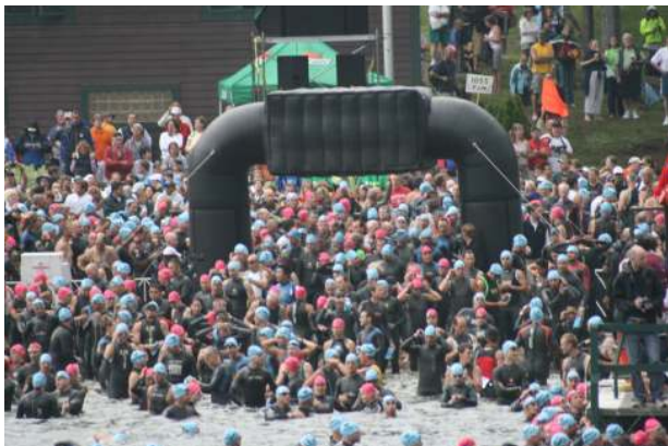
Ironman Lake Placid, July 21, 2008